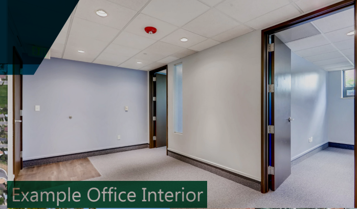
Example Office Interior