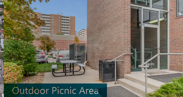
Outdoor Picnic Area