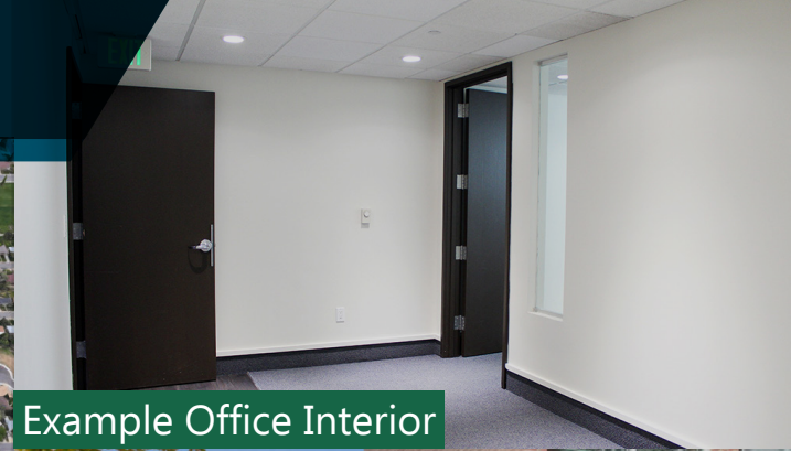
Example Office Interior