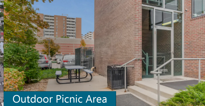
Outdoor Picnic Area