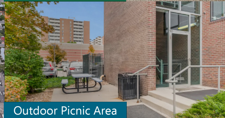
Outdoor Picnic Area