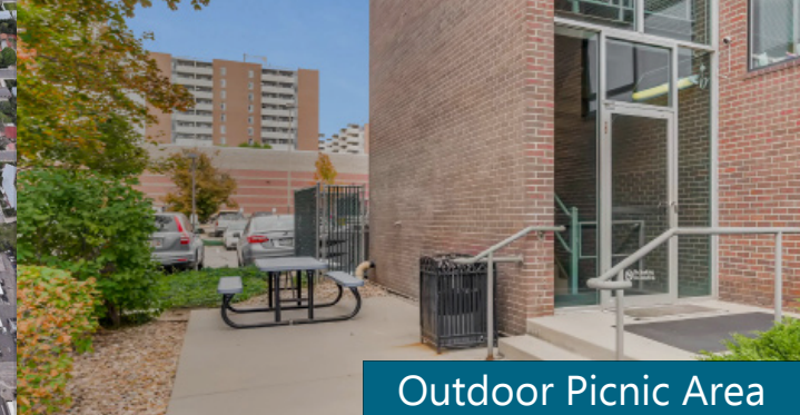
Outdoor Picnic Area