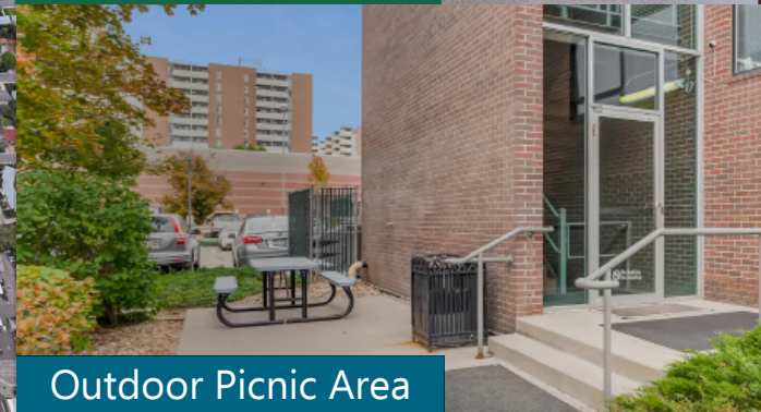
Outdoor Picnic Area