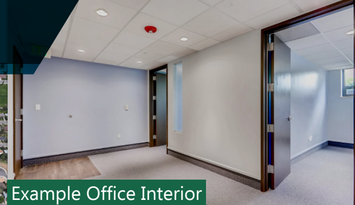
Example Office Interior