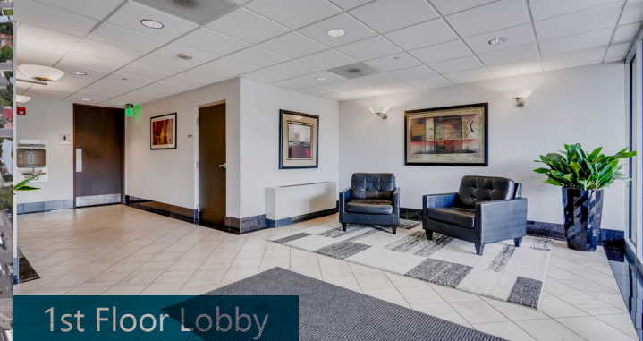
1st Floor Lobby